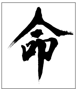
Ming (life). Calligraphy by Jianye Jiang.

Moving meditation accelerates the delivery of self-healing factors and accelerates the elimination of metabolic byproducts that can become toxic if they accumulate. What many practitioners, even in alternative and complementary medicine, do not fully realize is that t'ai chi and qigong are extremely powerful and