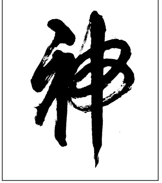
Shen (spirit). Calligraphy by Jianye Jiang.

T'ai chi is one particularly well-known form of qigong. Traditional t'ai chi consists of 108 separate movements that flow together into a specific order. There are several kinds of t'ai chi, including: Yang Style, Chen Style, Wu Style, and others. Most of these schools of t'ai chi have created modified short forms that allow for beginners to learn more quickly to work toward wellness and master stress, for elders to have an abbreviated practice that is easier to learn, and for patients who are ill to practice without too much distracting complexity.